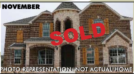
PHOTO REPRESENTATION. NOT ACTUAL HOME

1624 Fence Post • Brentwood • 4250 sf 5 BD • 4 BA • Study • Game • Media • 3 Car NEW Elevation (not shown), backs to greenbelt $333,422 $303,422